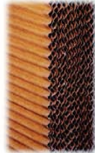
5090 high performance cooling pads